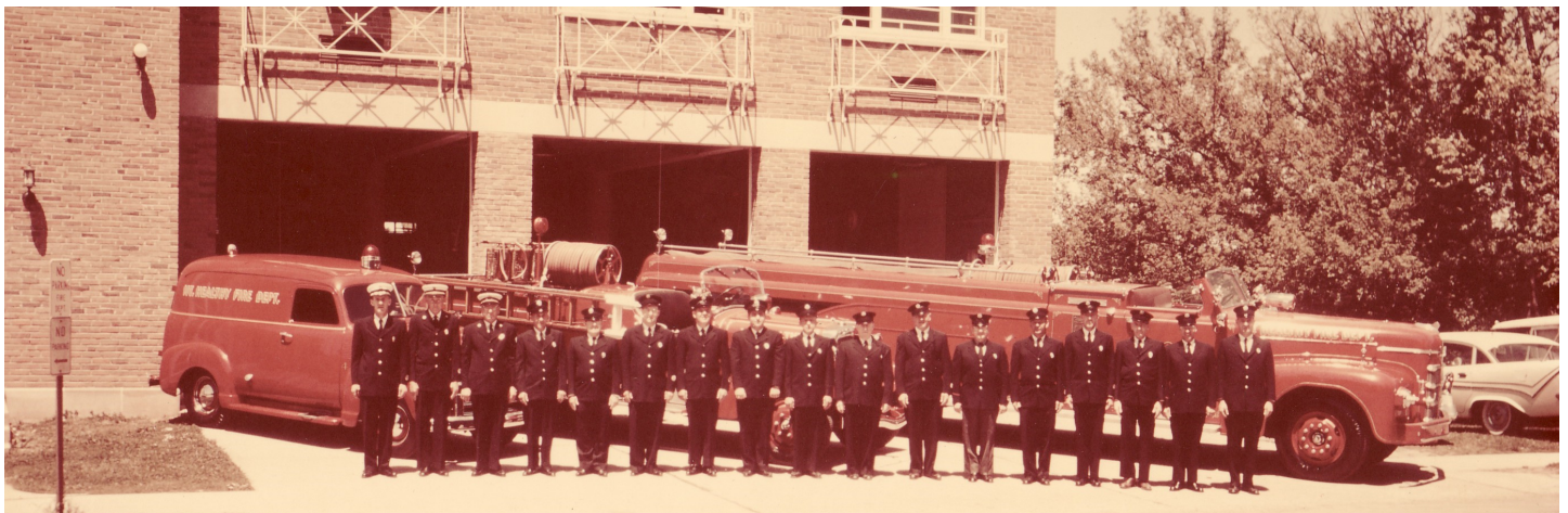
Mt. Healthy Fire Department, 1960s